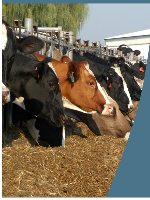
Have herd health concerns? We can help!

The Wisconsin Farm Center's Herd-Based Diagnostics Program provides veterinary consulting and diagnostic testing services to Wisconsin dairy farmers.